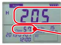
Image of Display