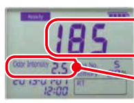
Image of Display