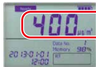
Image of Display